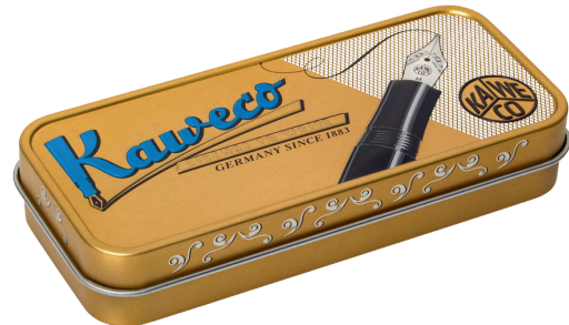
Nostalgic Tin (gold)

With each purchase of a Kaweco “metal” pen in a gift tin, the customer should receive: