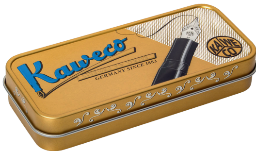
Nostalgic Tin (gold)