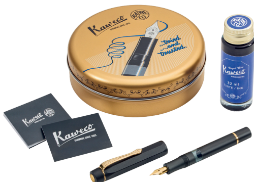
Piston AL Sport Starter Set