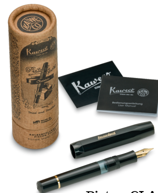
Piston CLASSIC Sport 3