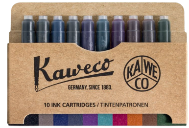
Kaweco Ink Cartridges 10-pack colour mix

Kaweco has 11 different coloured ink cartridges on offer (including a “Glowing Yellow” highlighter ink cartridge), and a multipack containing 10 of the colours.