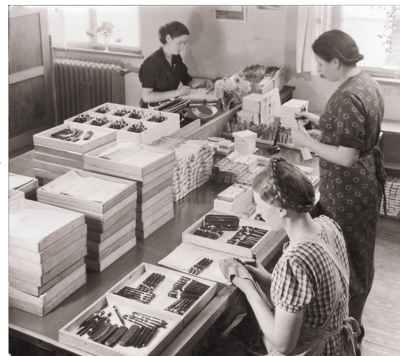
The assembly in Heidelberg/Handschuhsheim. Kaweco began manufacturing in Nuremberg from 1994.

Kaweco are constantly working on new materials, surfaces, designs and products to be ahead of the times and to thrill with exciting new developments. Their products are available in contemporary colours and materials. For example, the Kaweco Sport is available in high-quality plastic, aluminium, brass and brushed stainless steel. The LILIPUT series comes in copper, brass, aluminium and stainless steel and even in a rather special "Fireblue" finish.